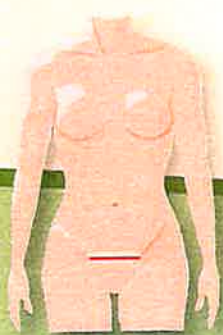
Open Hysterectomy Incision