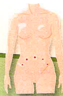
da Vinci ® Hysterectomy Incisions